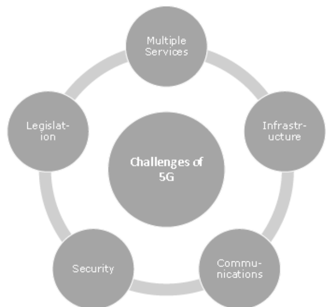
Figure 1. 5G network Common Challenges.

The challenges of 5G networks include infrastructure investment, technological complexity, and lack of standards for certain applications. Understanding these challenges is essential for developing strategies to overcome them and ensure successful deployment of 5G networks. It can also inform the development of innovative solutions and identify potential risks and vulnerabilities in the network infrastructure. Studying the challenges of 5G networks is crucial for the successful implementation and deployment of 5G networks and for improving their performance and capabilities [7-10]. Figure 1 shows 5G technology faces challenges in offering services to heterogeneous networks, standardization, infrastructure, communication, navigation, sensing, security, privacy, and legislation of cyberlaw. These challenges need to be addressed to ensure the success of 5G and protect personal data.