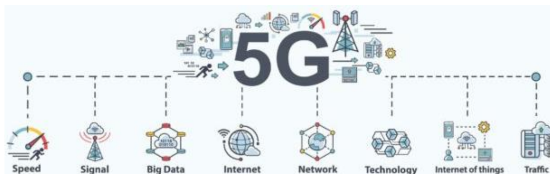
Figure 2. Opportunities of 5G networks.

nologies and solutions that can improve the performance and capabilities of 5G networks, leading to innovative solutions. Overall, studying the opportunities of 5G networks is critical to drive innovation, economic growth, and societal improvements. Figure 2 illustrates that 5G provides higher spectral efficiency, ultra-reliable and low latency signals, and a new network architecture, which leads to increased connectivity. This increased connectivity can help organizations to explore new revenue streams and offer better products and services to their customers and other businesses.