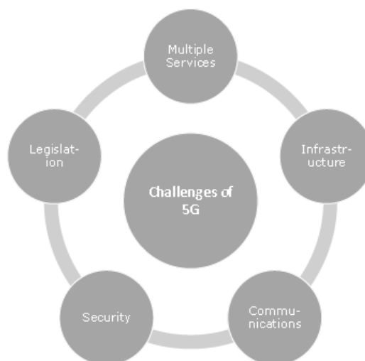
Figure 4. Some key Challenges of 5G Network.

The challenges of 5G networks are the obstacles, difficulties, and potential risks associated with the deployment and operation of 5G networks. Figure 4 shows the some key challenges of 5G Network.